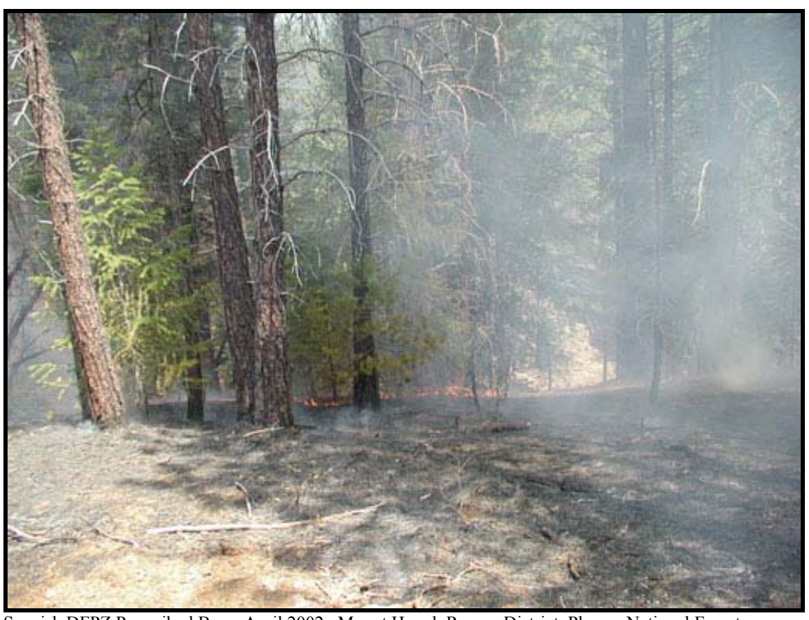
Spanish DFPZ Prescribed Burn, April 2002. Mount Hough Ranger District, Plumas National Forest.

STATUS REPORT TO CONGRESS FISCAL YEAR 2002